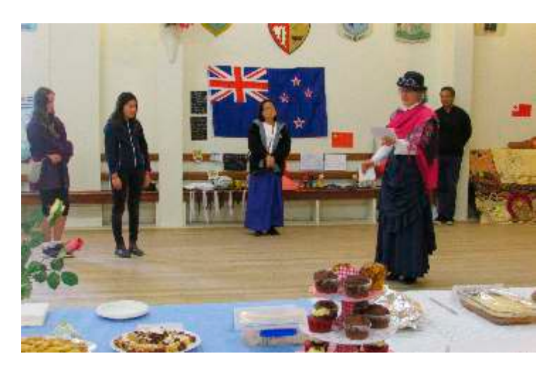
Waitaki Multicultural Council - International afternoon at the Scottish Hall on Sunday 13th Aug.