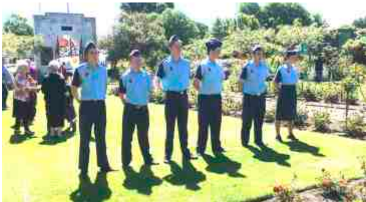
Local members of the Air Training Corps. Taking part in the recent Remembrance Day Service.