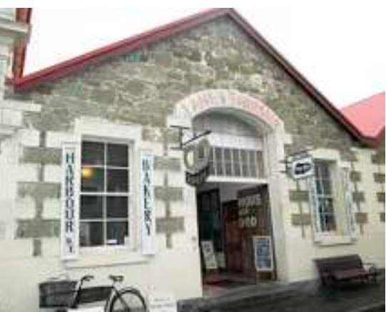
conspicuous (Now Harbour Street Bakery and Deja Moo - Ice Cream - the best in town) for its use of local greystone.

Forrester and Lemon's first grain store was built for A H Maude in 1875 was rather simple in design compared to their later projects. The Maude grain store is