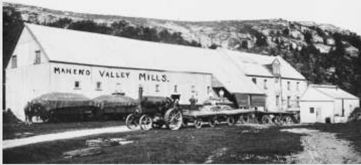
Waitaki District Archive 692P