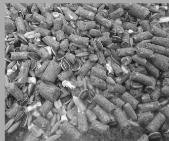
Rabbit and Guinea pig Mixes