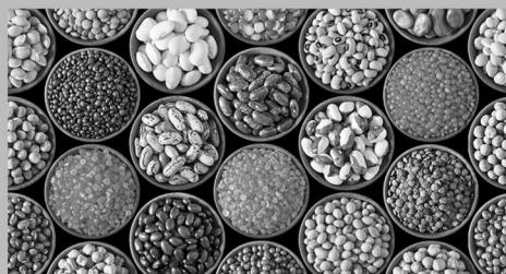
Peas, Beans and Lentils a HUGE selection