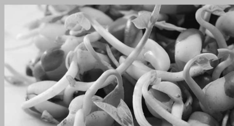
Kings Seeds Sprouts