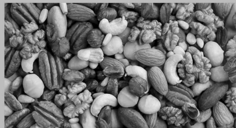
Nuts we have a HUGE selection