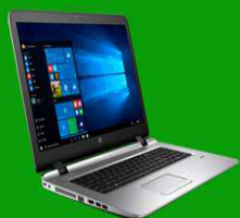
Laptop & Desktop