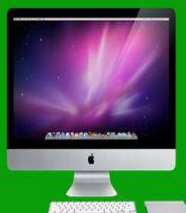
Macbook & iMac