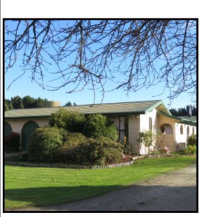
tunnel house Web Ref # SWOU11730