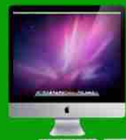
Macbook & iMac