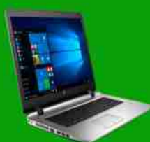
Laptop & Desktop