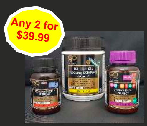
For Healthier Eyes

Introductory offer RRP $28.50 You save $8.50