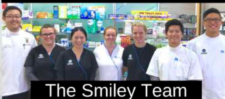
The Smiley Team