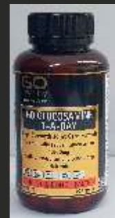
GO Healthy - NZ Go Glucosamine 1-A-Day Now $22.99 RRP $40.50

these DEALS only available Tuesday 23 rd - Monday 29 th July – Plus more in store