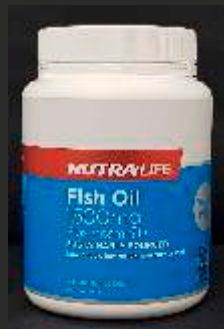
NUTRA-LIFE Fish Oil 1500mg Our Price $21.99 RRP $47.99