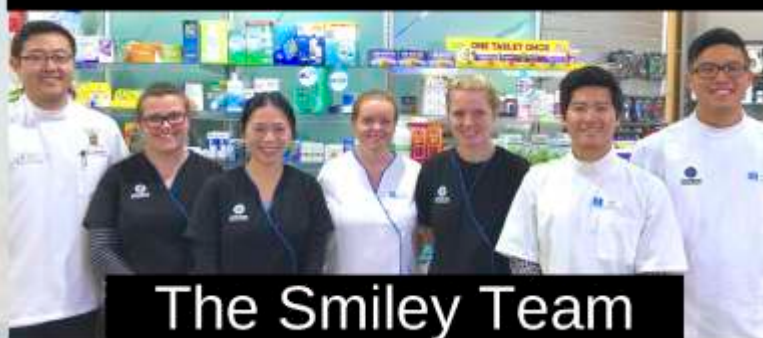
The Smiley Team