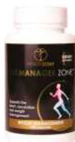
Fat Manager Zone