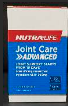
NUTRA-LIFE Joint Care >>Advanced 30 Capsules Our Price $17.99 RRP $36.99