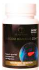
Glucose Manager Zone