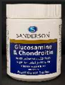
SANDERSON Glucosamine & Chondroitin 200 capsules Our Price $32.99 RRP $78.50