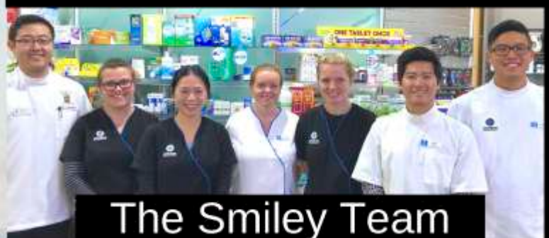
The Smiley Team