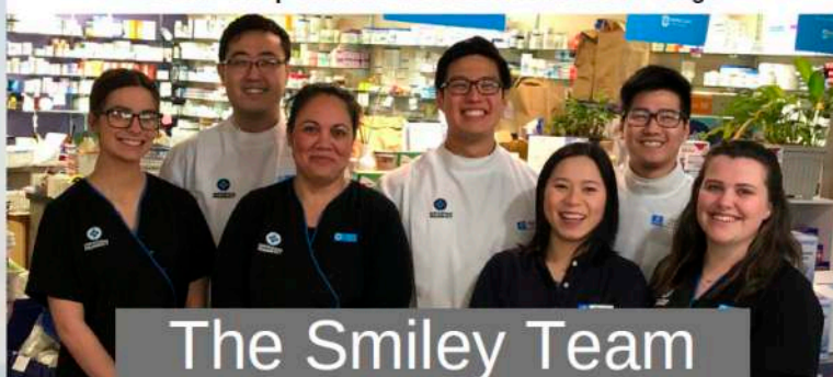
The Smiley Team

for the Shop with the best service in North Otago