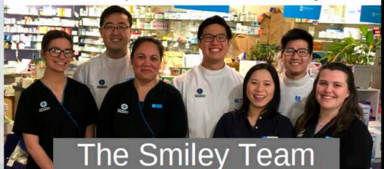
The Smiley Team

for the Shop with the best service in North Otago