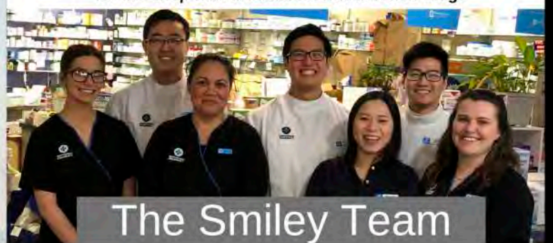
The Smiley Team

for the Shop with the best service in North Otago