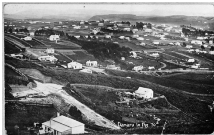
Oamaru in the 1870s.

admin@milligans.co.nz attaching a copy of your CV showing your experience before 12th June 2020. Or drop into the main office at Milligans Food Group, 1 Chelmer Street, Oamaru.