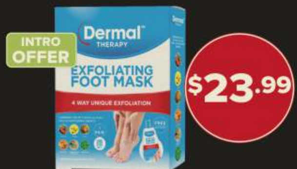
Dermal Therapy Exfoliating Foot Mask 1 Pair

Oamaru Pharmacy, 171 Thames st, Oamaru Ph. 03 434 8741, Monday - Friday 8am - 6pm Saturday 9.30 - 5pm, Sunday 10:30 - 4:30pm