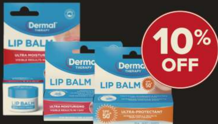
Dermal Therapy Lip Balm Range