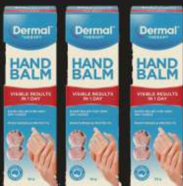
Dermal Therapy Hand Balm 50g